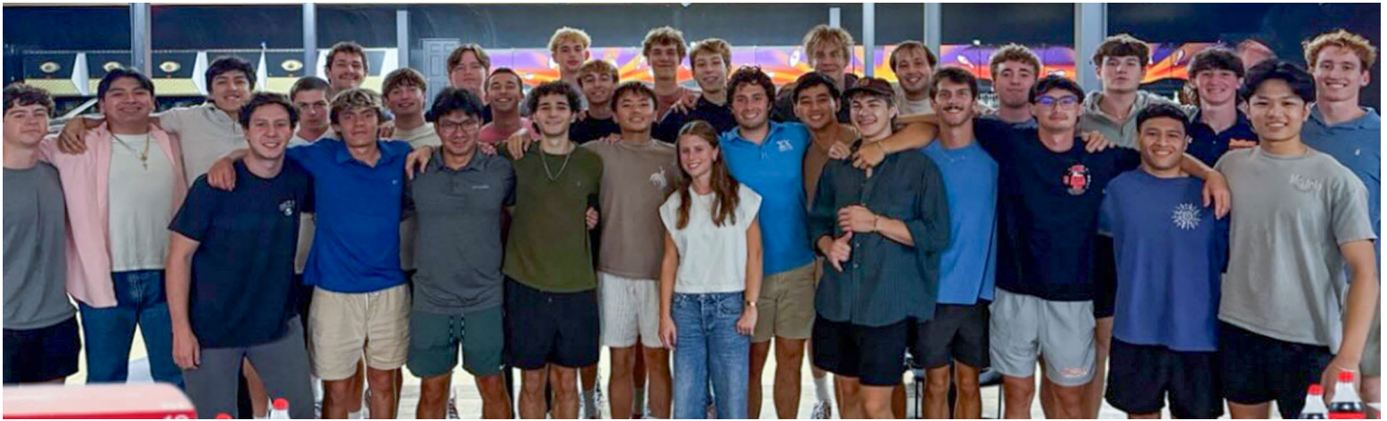
Brothers (and our Sigma Chi Sweetheart) kick off the semester with a bowling night. From strikes to laughs, it was the perfect way to bond and start the year strong.