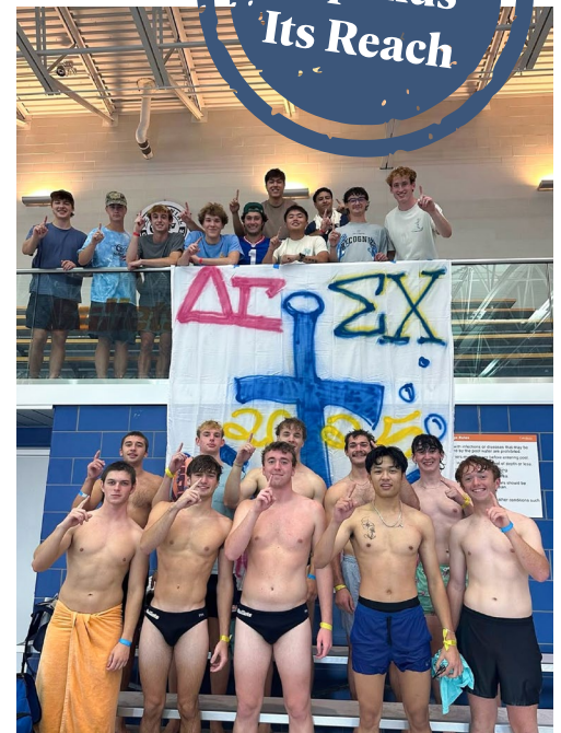
Our brothers aren't afraid of water! Theta took home the gold in this year's Anchor Splash, hosted by Delta Gamma in September.